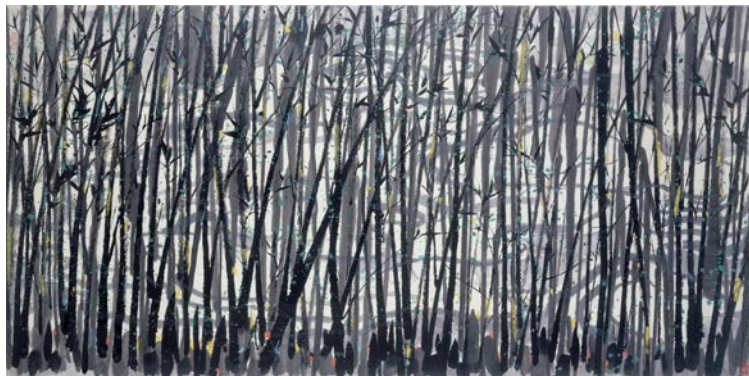
Wu Guanzhong (1919-2010) Bamboos forest and irrigated fields, 1992 Ink and colours on paper 67.8 x 137 cm M.C. 9911 Donated by the artist, 1993