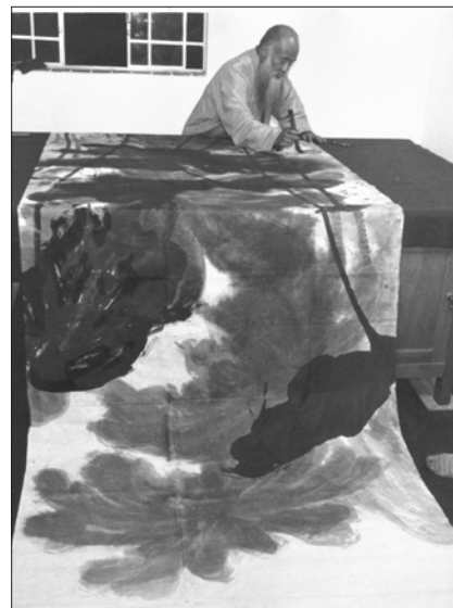
Chang Dai-chien (Zhang Daqian) drawing the lotus leaves of the penultimate left-hand panel Giant Lotus , 1961