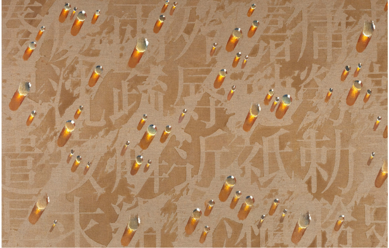
Kim Tschang-yeul (1929-2021), Recurrence (detail), 2004

Tinfix, oil and acrylic on canvas. 162 x 130 cm. M.C 2014-4. Purchased, 2014 © Paris Musées / Musée Cernuschi © Kim Tschang-yeul / Adagp, Paris, 2023