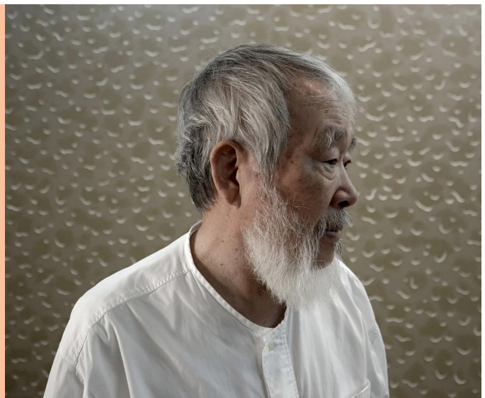
Kim Tschang-Yeul

The public initiative-based Kim Tschang-Yeul Museum, created in honor of the artist, opened on the island of Jeju, South Korea, in 2016.